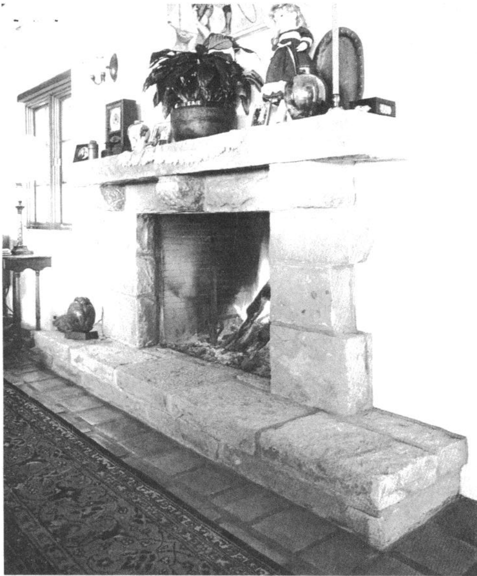
The weighty presence of hand-wrought stonework is entirely in keeping with the sturdy detail in this Spanish Colonial Revival style home. Soto used a plywood template to regulate the curvature on the bottoms of the corbels that support the mantel, and he shaped them with a pitching chisel.

If opposite faces are not in the same plane, mark sides with parallel lines and remove excess stone with a pitchu?g tool.