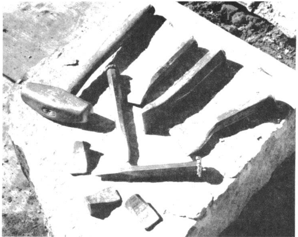
Clockwise from the top, Soto's hammer, a point, two pitching tools, a toothed chisel and a lifter. The three wedges were custom made by a blacksmith.

The chisels are of four varieties: pitching tools, points, lifters and toothed chisels. A pitching tool looks a little like a brick chisel, but its cutting edge is blunt. It's used to whack off pieces of stone near the edge of a block. A point is a cold chisel with a tip that's about as sharp as a railroad spike. It's used to excavate the holes needed to split the stones, and to dress the stone. A lifter resembles a point with a blunt tip, and Soto uses it primarily to begin the slots in the stone that will accept the wedges. The toothed chisel creates a texture on the stone's surface that resembles cross-hatching.